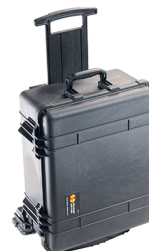
1560MWF With Foam